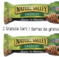
2 Granola bars / Barras de granola