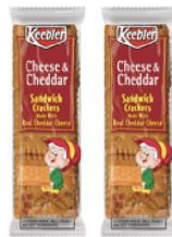
2 Vacuum packed cheese & crackers Balletas con queso embolsada