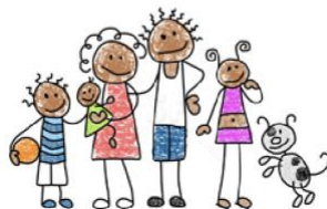
1 Family picture / Foto familiar