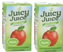
2 Juice boxes / Cajas de jugo