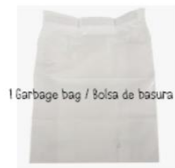
1 Garbage bag / Bolsa de basura

During the open house, families will receive a gallon-sized, sealable plastic bag with guidance on what to purchase to put in the bag. Please follow the guidelines and bring the bag filled with all items as soon as possible.